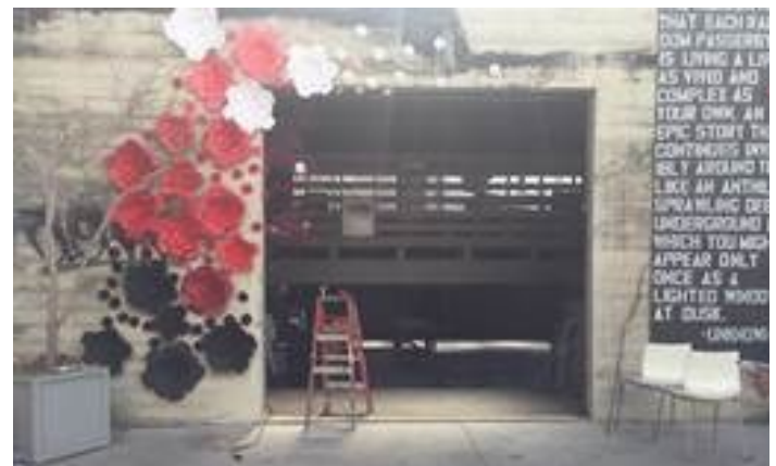
Installation designed and created by SFState interior design students