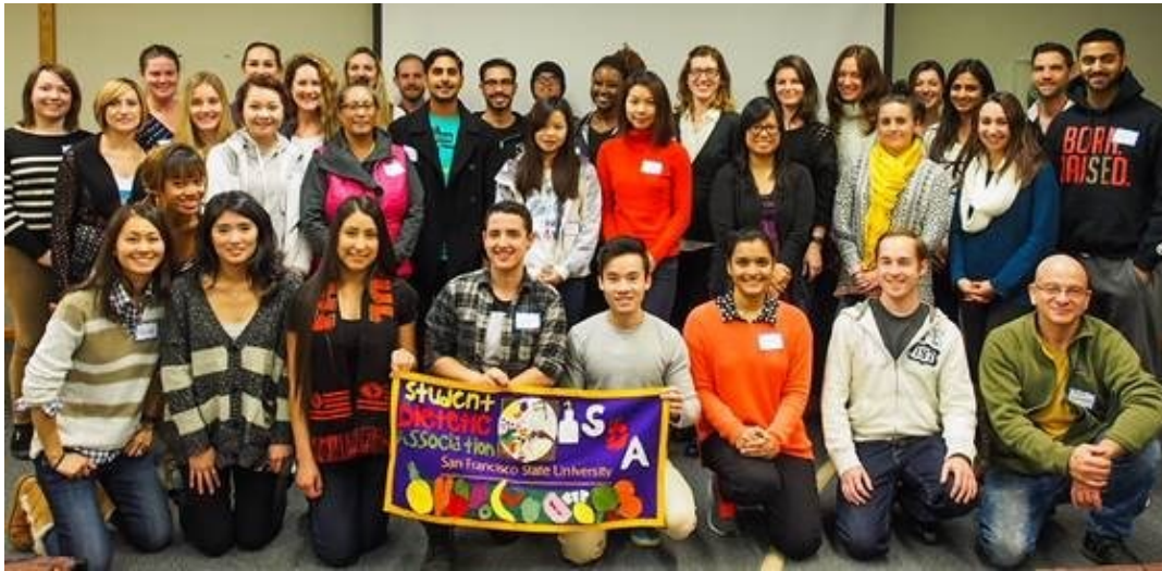
Student Dietetic Association members 2015